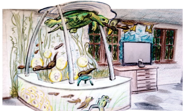
Conceptual drawing for a new interactive pond exhibit in the Nature Center at Bendix Woods County Park.

If you would like to be a part of the fundraising efforts for this project, you can mail a check payable to: St. Joseph County Parks Foundation, 50651 Laurel Road, South Bend, IN 46637. In the memo please indicate "Bendix Woods pond exhibit".